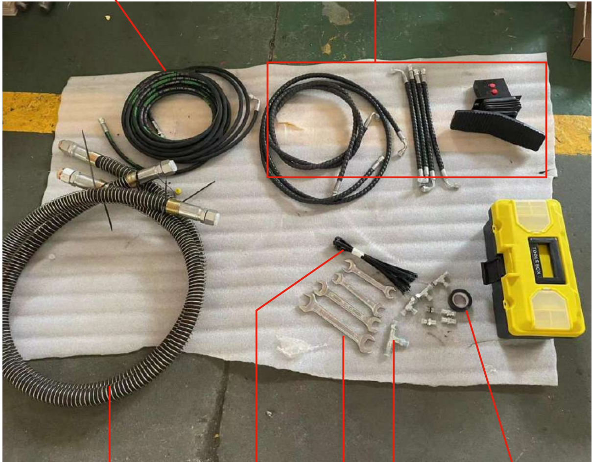
接破碎锤主油管 Connect the breaker pipe